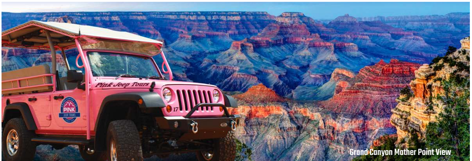
Grand Canyon Mather Point View

Group Sales 928 • 203 • 7040 / groups@pinkjeep.com • pinkjeep.com