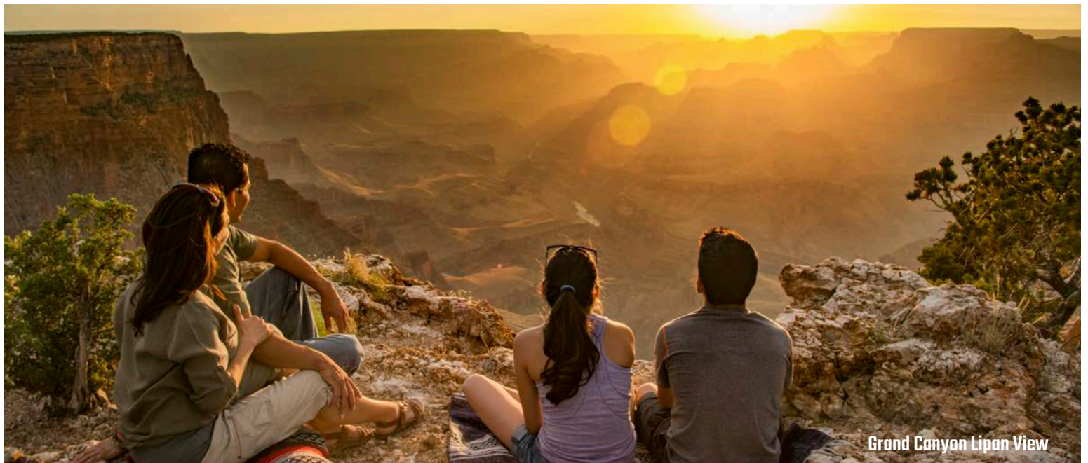
Grand Canyon Lipan View