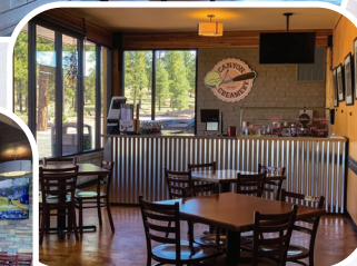
Canyon Creamery Premium Ice Cream & Treats

Gluten Free & VIP Meal Options available at an additional charge.