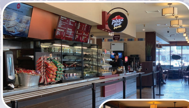
Seating for 180 guests.